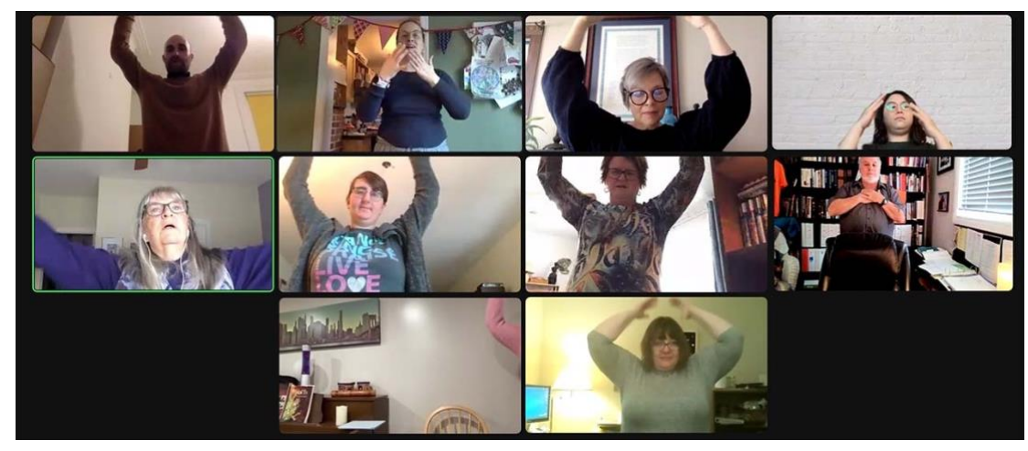
Full bodied prayer in the online Spiritual Practice learning circle in January 2022.