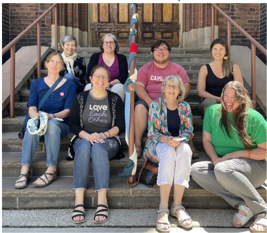
Learning on Purpose 2022, in person, at Metropolitan United, London, ON.