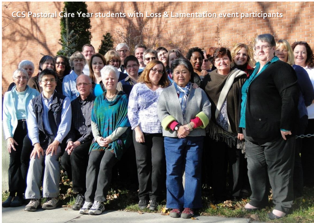
CCS Pastoral Care Year students with Loss &amp; Lamentation event participants