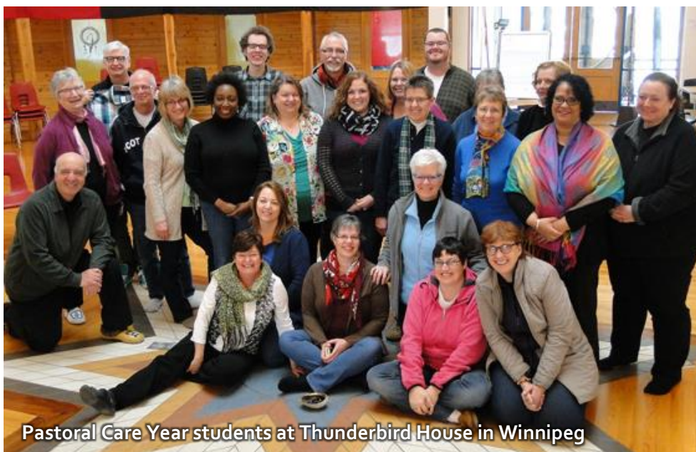
Pastoral Care Year students at Thunderbird House in Winnipeg

You make student learning at CCS possible. You rock!